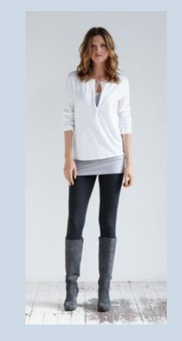
Tops are too short

Leggings and Jeggings are permitted only when worn under a dress, skirt, or tunic that is of the appropriate length to be worn alone.